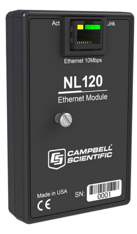
FIGURE 5-1. NL120 Ethernet Module