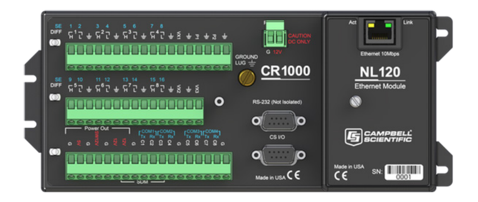
FIGURE 4-1. NL120 attached to a CR1000

After powering down the datalogger, plug the NL120 into the datalogger peripheral port (see FIGURE 4-1). Attach Ethernet cable to the 10Base-T port. If using the 28033 Surge Protector, connect the other end of the Ethernet cable to the 28033 and connect another Ethernet cable to the other end of the 28033. Restore power to the datalogger.